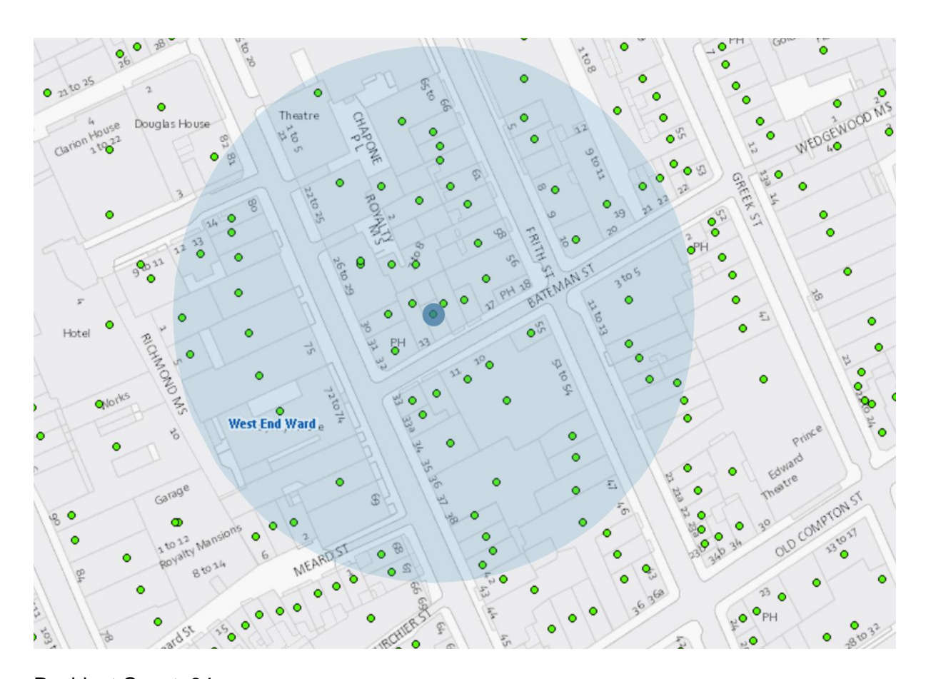
Resident Count: 94